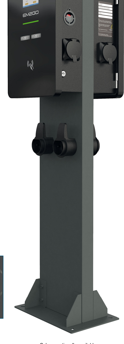
Column optionally available